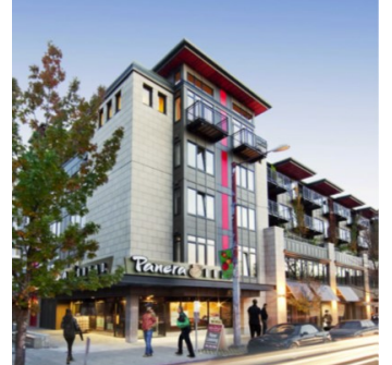
The top results of the commercial and housing visual preference survey, May 2018

Oak Grove Plaza is also being marketed by Thalhimer as the new leasing agent for the property with small shop and anchor space available up to 11,000 sf. Both the Keagy and Oak Grove Plaza properties benefit from existing signalized intersections and high income demographics desired by commercial tenants.