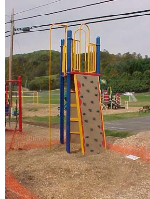
Play Area A – Climbing Wall