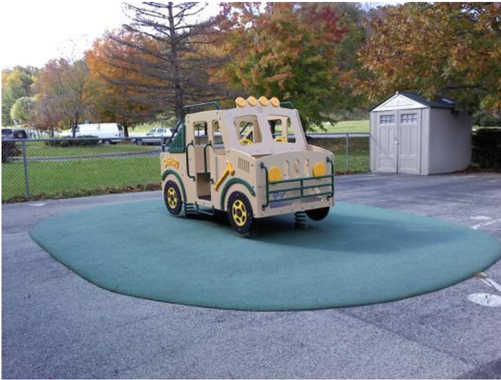
Area E - Preschool