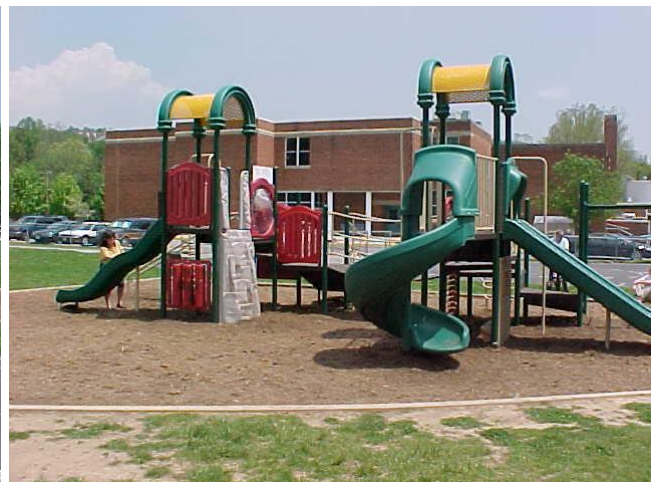
Back Creek Elementary