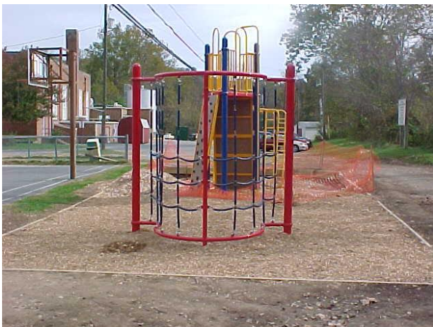
Play Area B – Little Tyke Component (Ages 5-12)