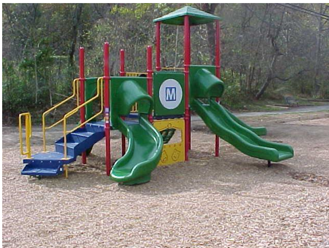
Back Creek Elementary