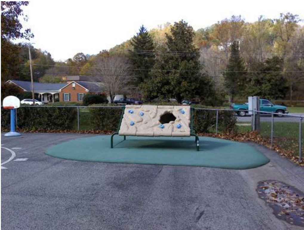
Back Creek Elementary