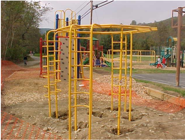
Play Area A – Spider Climber