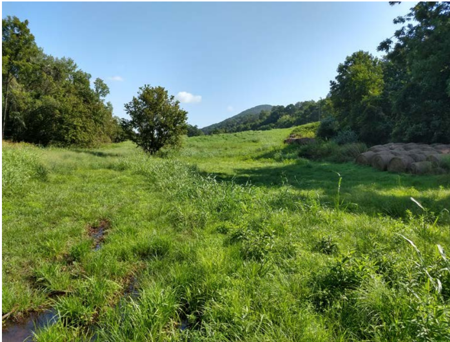
Picture 1 - Looking towards earth disposal area at rise ahead. Note wet area in foreground.