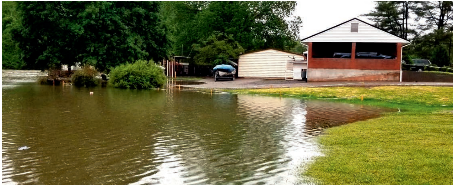
It pays to be prepared, as flooding may occur at any time, with little or no warning.

The Federal Emergency Management Agency (FEMA) defines SFHAs as land areas that are at high risk for flooding. These areas are indicated on Flood Insurance Rate Maps (FIRMs) and on Digital Flood Insurance Rate Maps (DFIRMs).